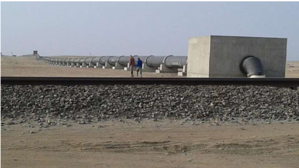
FIGURE 2 – A PHOTO SHOWING NAMWATER PIPELINE FROM THE AREVA DESALINATION PLANT THAT CROSSES UNDERNEATH THE RAILWAY EAST OF SWAKOPMUND (HARTZ, C., 2017)

Details about the crossings and conditions for working in the vicinity of the crossings are to be obtained from NamWater when the application for Way of Leave is submitted by the Engineer and approved by NamWater. The contractor and ER are to consult closely with NamWater before and during construction activities occurring in the pipeline crossing areas.